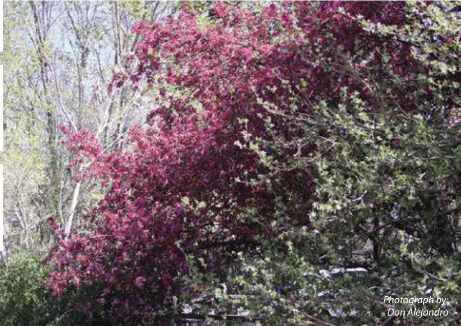
Photograph by: Don Alejandro